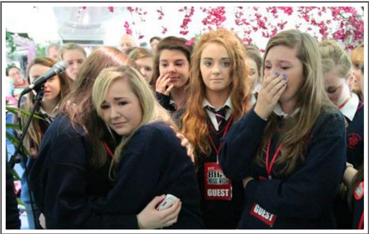
Presentation Clonmel Pupils on board RTÉ's Big Music Week train.

The performance was part of RTÉ's Big Music Week Train, which is travelling across Ireland to 'celebrate Irish music', hosting performances from the likes of Christy Moore and Kodaline.