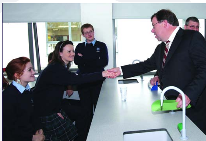
Pictured above An Taoiseach Brian Cowen TD meets students from Rahan Presentation School at the launch of the D2D project.

Another CEIST school, Killina Presentation Secondary School in Offaly was selected recently for an exciting pilot science teaching project. The D2D project involves the sharing of science classes between students in Killina Presentation Secondary School and Researchers in the Georgia Institute of Technology. This provides the students with access to world-class