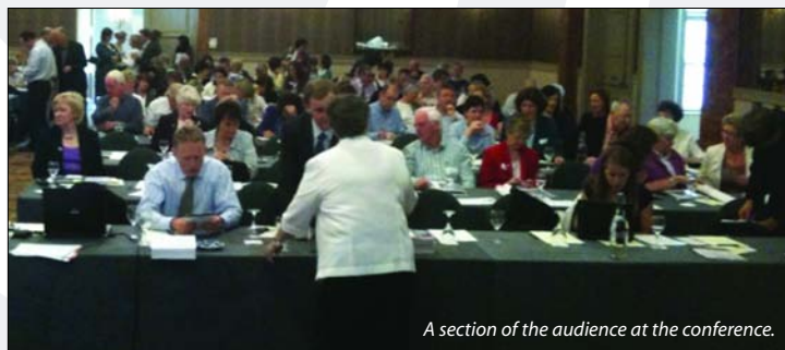
A section of the audience at the conference.