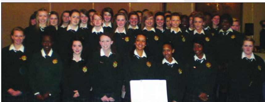
Ard Scoil na Tríonóide Choir, Athy, Co. Kildare, getting ready to sing on the opening morning of the conference.