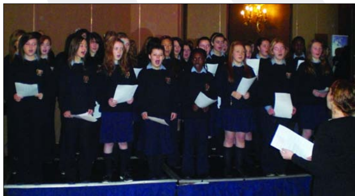
Presentation Secondary School Choir, Kildare Town, performing at the start of the 2nd day of the conference.