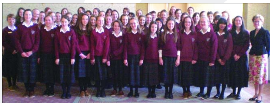
Choir of St Mary's Secondary School, Naas, Co. Kildare, who closed the CEIST 2010 conference.

We would also like to extend our sincere gratitude to the three excellent school choirs who participated at the conference. The three schools were Ard Scoil na Tríonóide Choir, Athy, Presentation Secondary School Choir, Kildare Town, and St. Mary's College Choir, Naas.