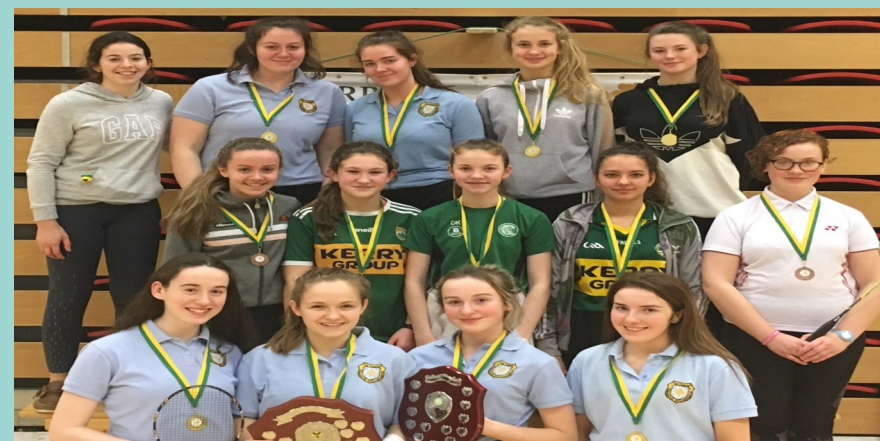
U16 BADMINTON TEAM