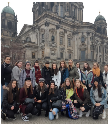
5th Year History Trip to Berlin