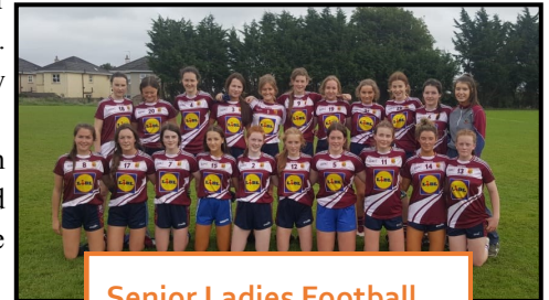
Senior Ladies Football