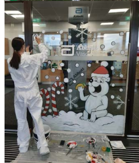
Art - Abbott Windows