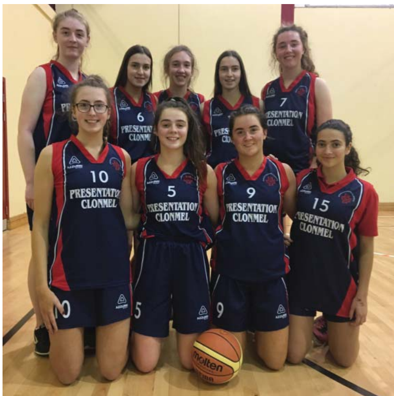
Under 19 Basketball Team

All the first years have begun training in preparation for their competition which starts in January. Two teams will travel to the Watershed in Kilkenny in December, to participate in Pres Kilkenny's blitz. Always a great day for the girls, it will be their first time playing in competitive games. st of luck to all the girls.