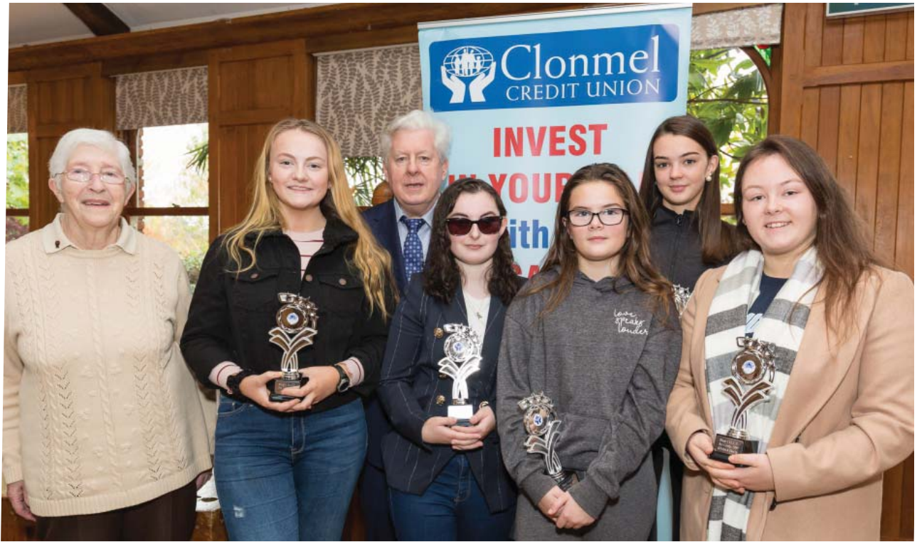
Credit Union Art Competition 2019