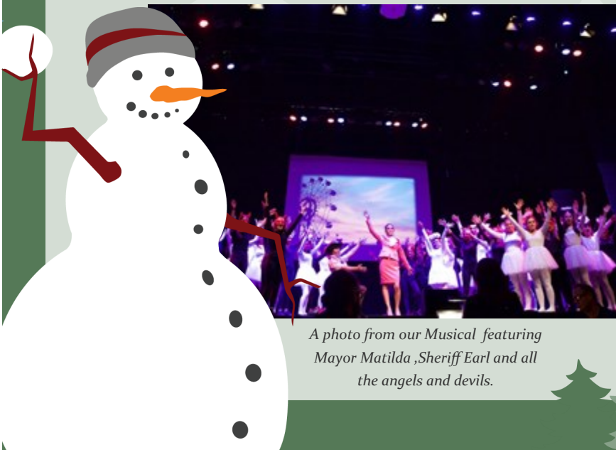
A photo from our Musical featuring Mayor Matilda, Sheriff Earl and all the angels and devils.

Future Leaders is a new module this year. It involves various aspects of sport, looks at journalism, nutrition, and coaching, as well as hosting blitzes, and attending matches.