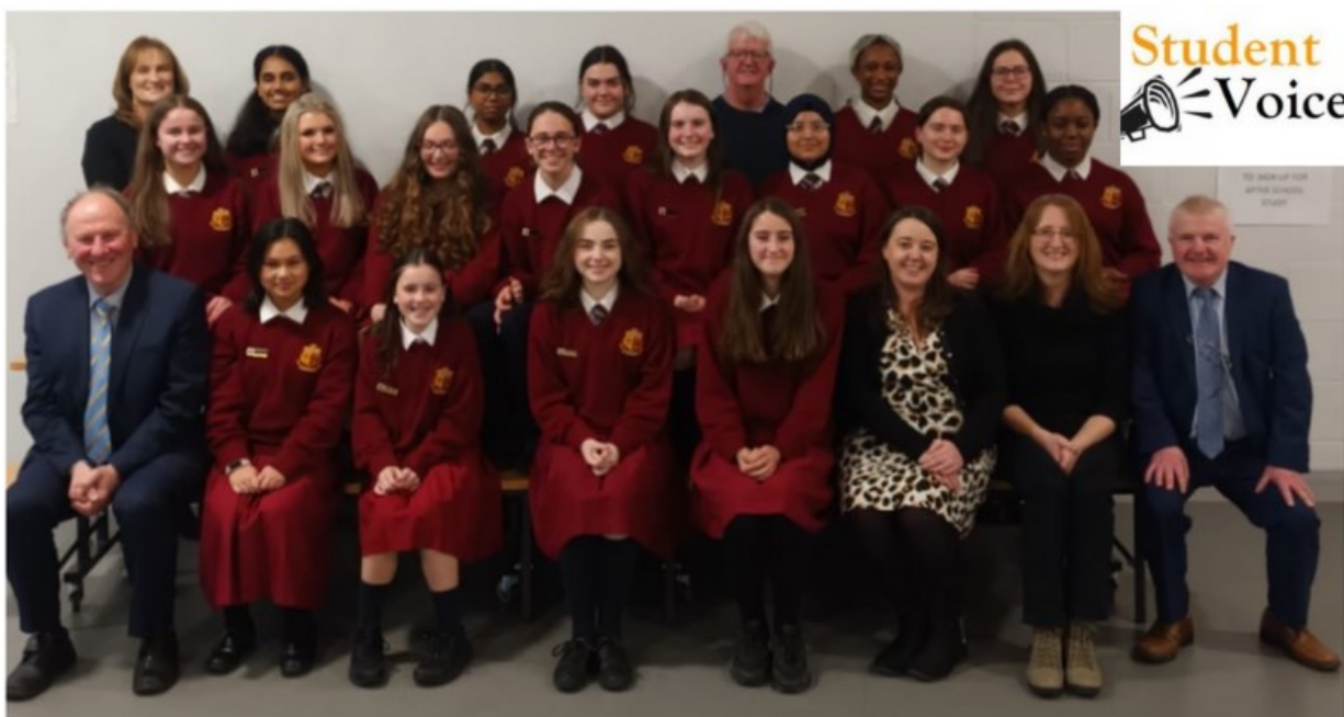
Meeting brilliant student leaders in Sancta Maria College Dublin with members of the BoM

Student Leadership programmes enable our students to seek and find the best paths to witnessing the values of CEIST in their school communities and beyond. We thank all those who establish, lead and support these programmes. The opportunity offered to students to participate in training, so that they can confidently take their place as members of Student Councils, is of immense value to their ongoing development as leaders and mentors within the CEIST school. The commitment to hearing and valuing the student voice as partner and member in CEIST schools has a real and profound influence on how our Catholic ethos is lived on a daily basis.