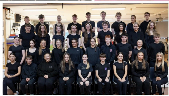
Presentation Secondary School & CBS High School Clonmel